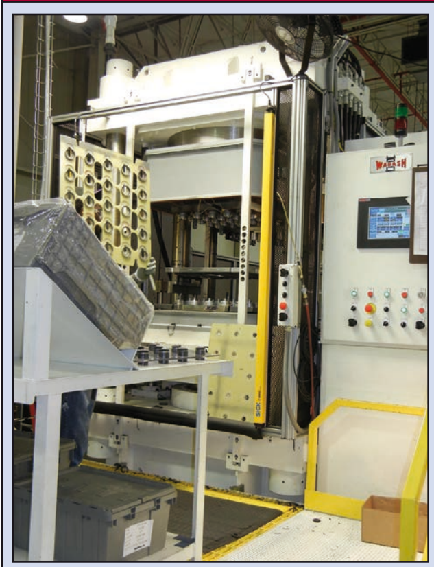
Figure 1 - Wabash press at Federal Mogul Athens