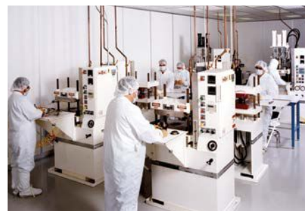
Clean room application