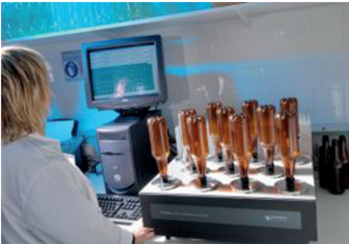
Test 11 chambers at once

One analyzer has the ability to evaluate a wide range of barrier alternatives and their corresponding performance.